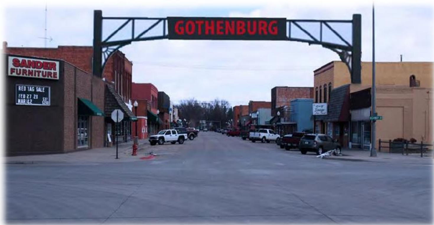
Figure 1: Entrance to Downtown

The following conceptual drawings show examples of how items that were mentioned as improvements could be implemented