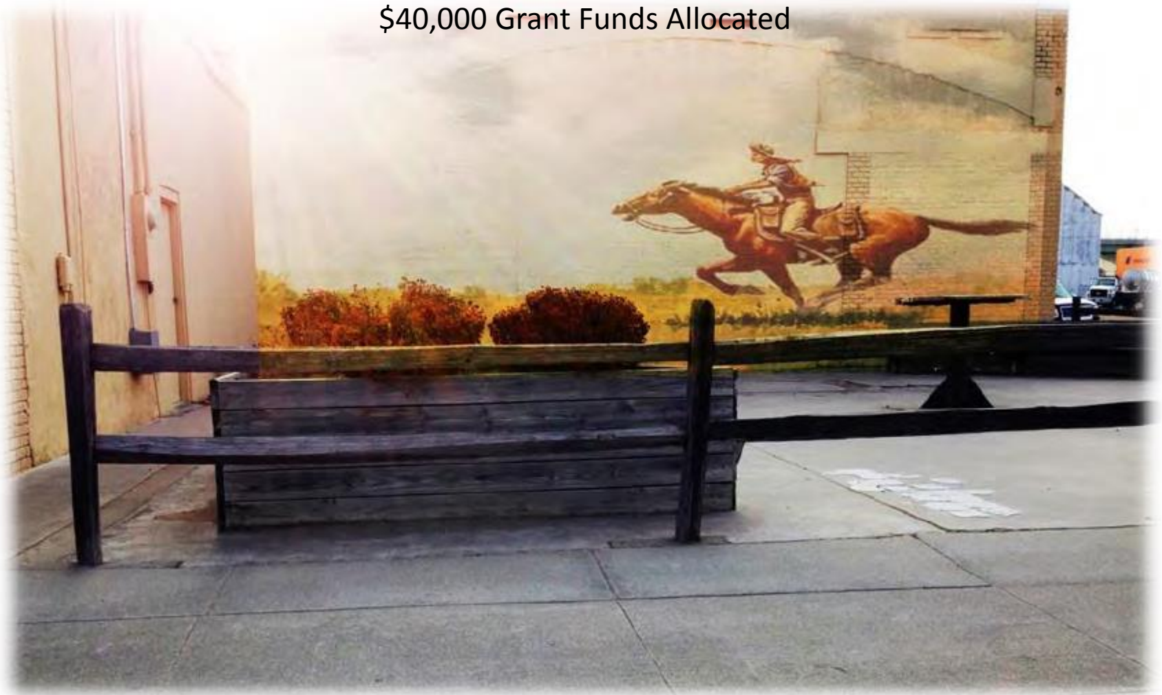
Figure 3: Mural #1