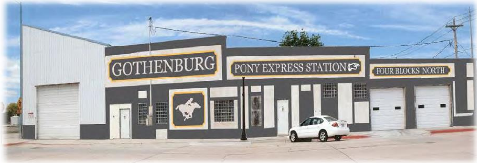
Figure 5: Directional Signage