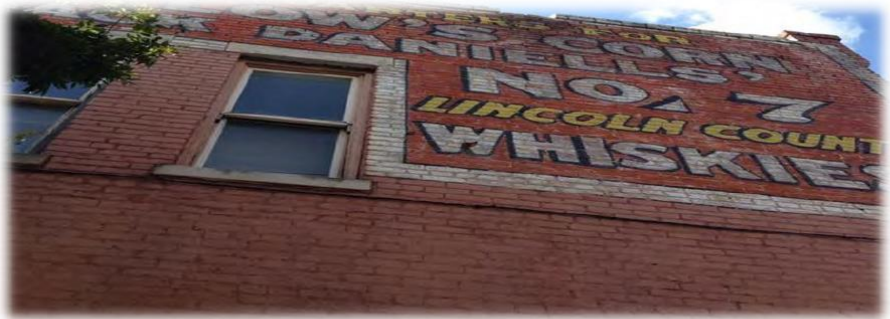
Figure 6: Restoring Ghost Lettering Example