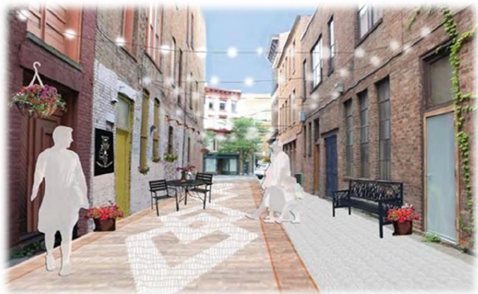
Figure 2: Alley Improvements